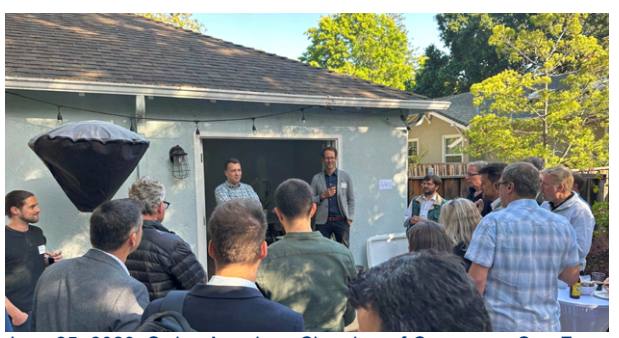
June 25, 2023, Swiss-American Chamber of Commerce San Francisco Chapter, Stammtisch, Swisscom Outpost (Garden), Palo Alto

See www.amcham.ch/events for more details