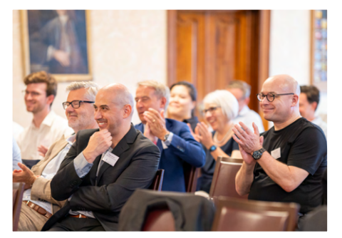
IMD World Competitiveness Report 2023 (3)