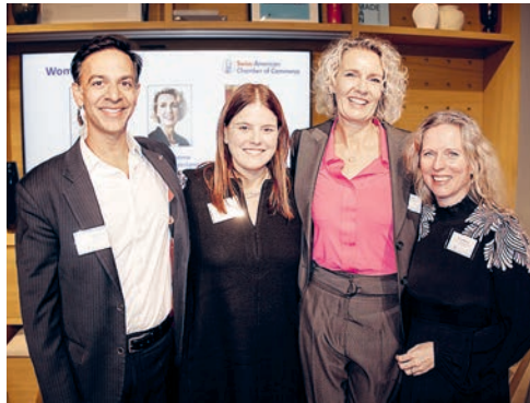
October 22, 2024, Panel discussion on Women in Tech at Cadillac City, the brand's flagship store in Zurich.