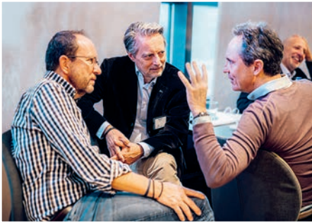
US Presidential Election Breakfast (4)