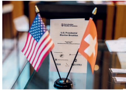
US Presidential Election Breakfast (4)